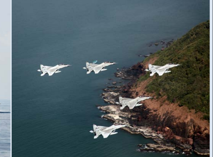
DATE OF OPENING 26 AUG 2017

Applications are invited from unmarried eligible male & female candidates for Short Service Commission (SSC) in Pilot/Observer/ATC entry of the Indian Navy for course commencing Jul 2018 at the Indian Naval Academy Ezhimala, Kerala. Candidates must fulfil condition of Nationality as laid down by the Govt. of India.